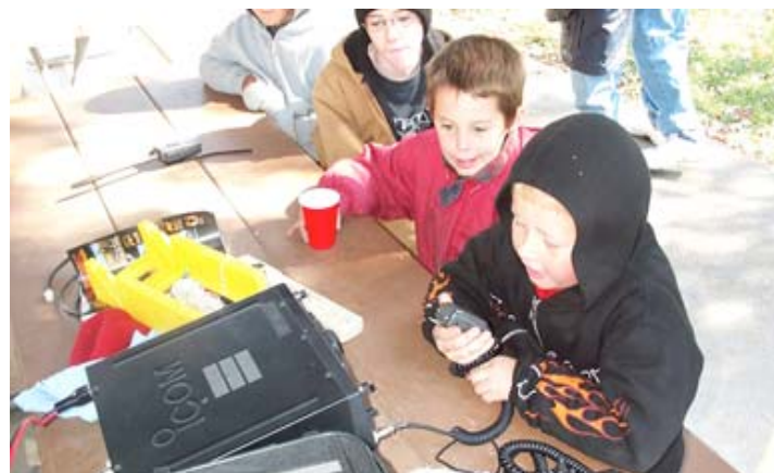
And here are the results of a Radio Club with members who will run for a club office.